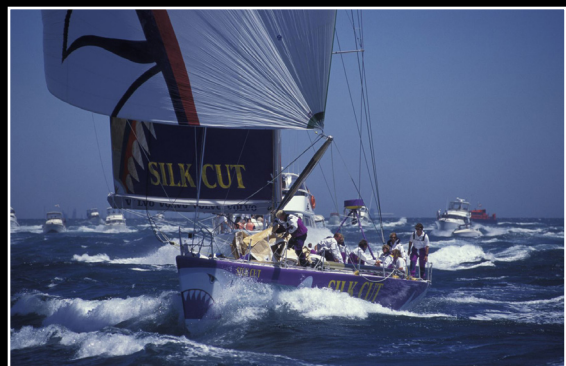
Silk-Cut 1997 - 1998