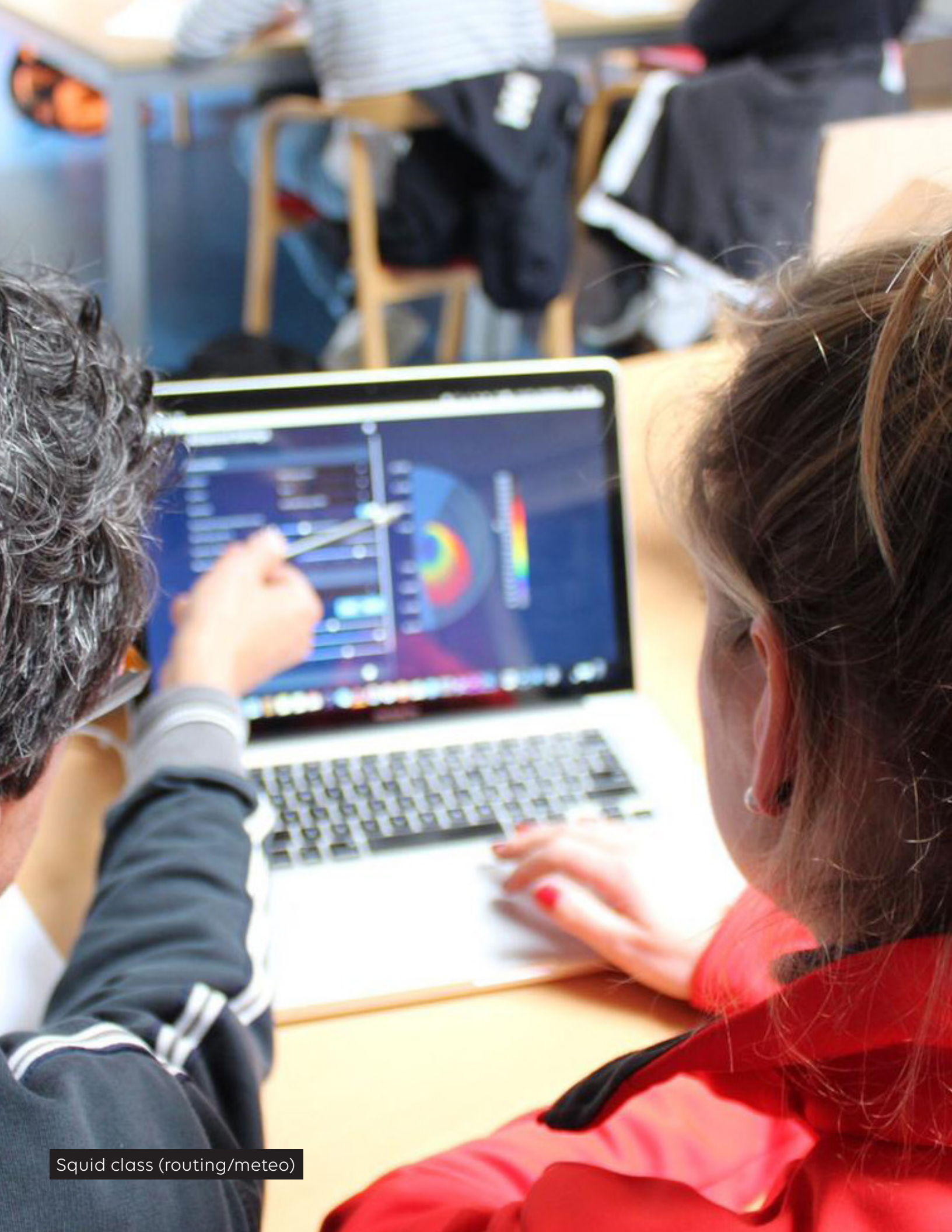
Squid class (routing/meteo)