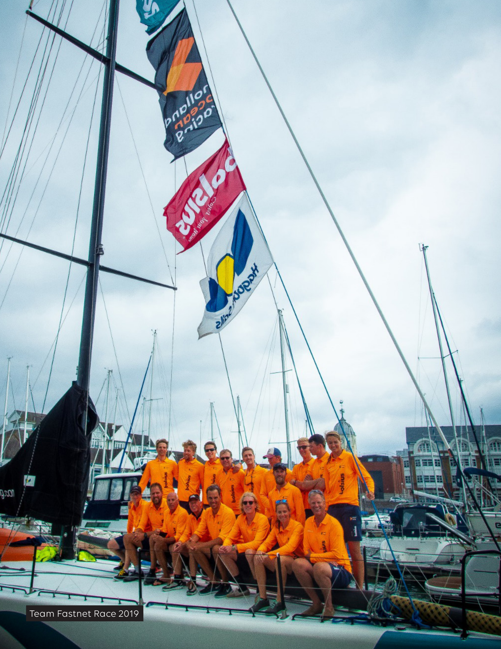
Team Fastnet Race 2019