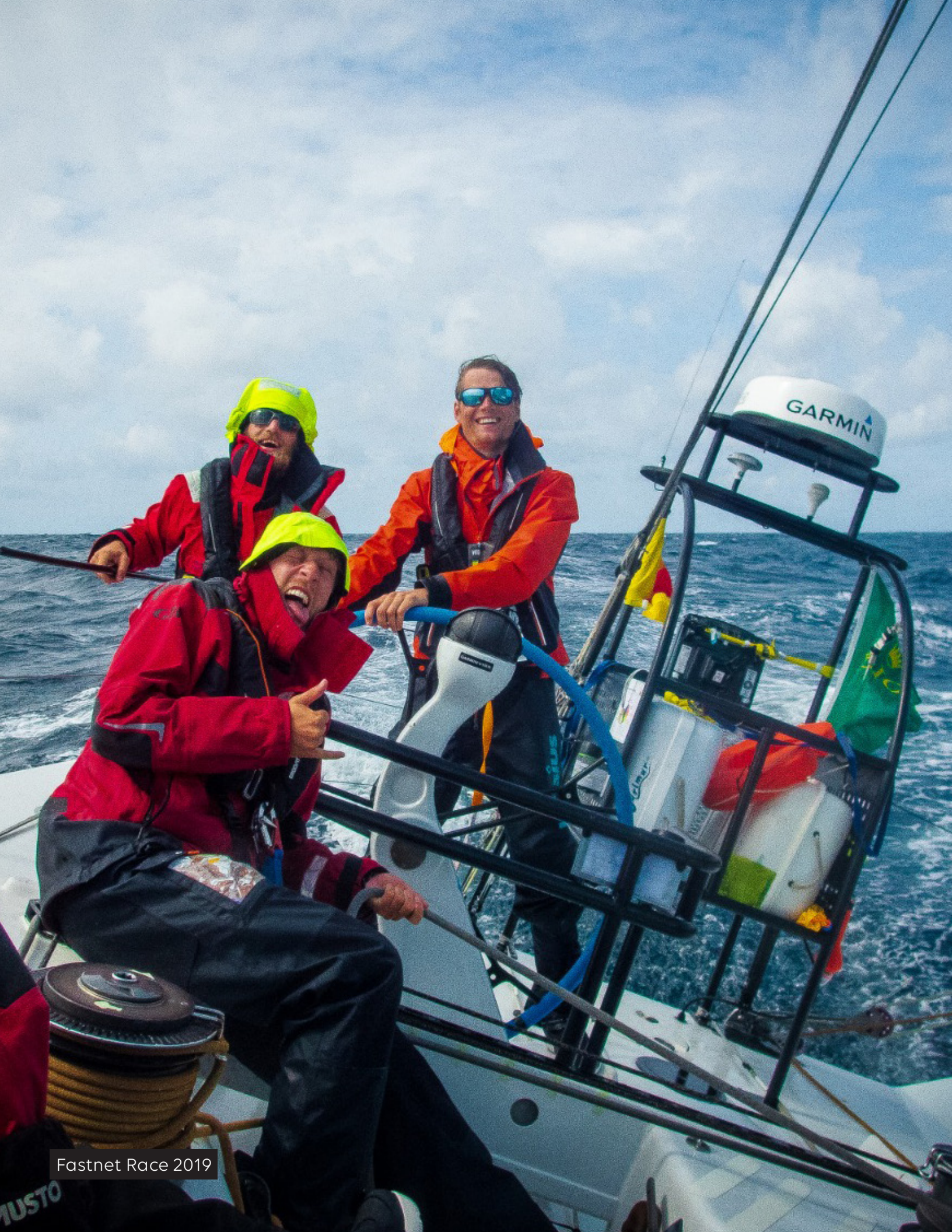
Fastnet Race 2019