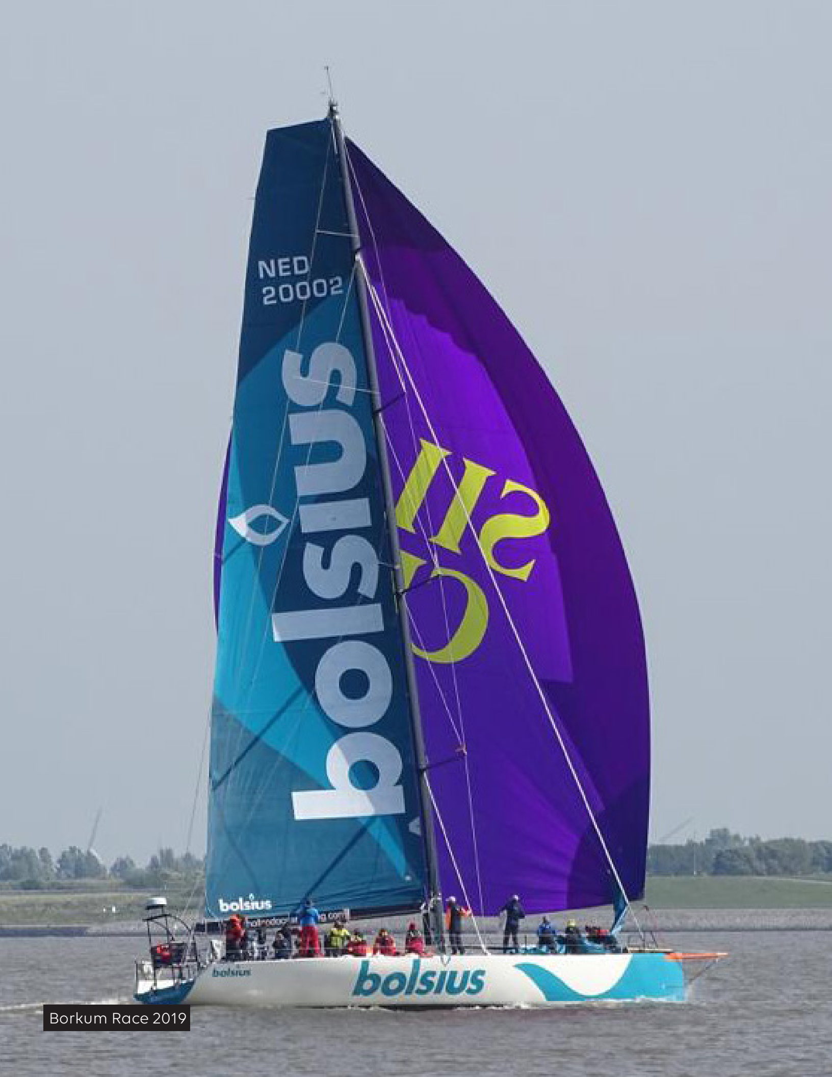
Borkum Race 2019