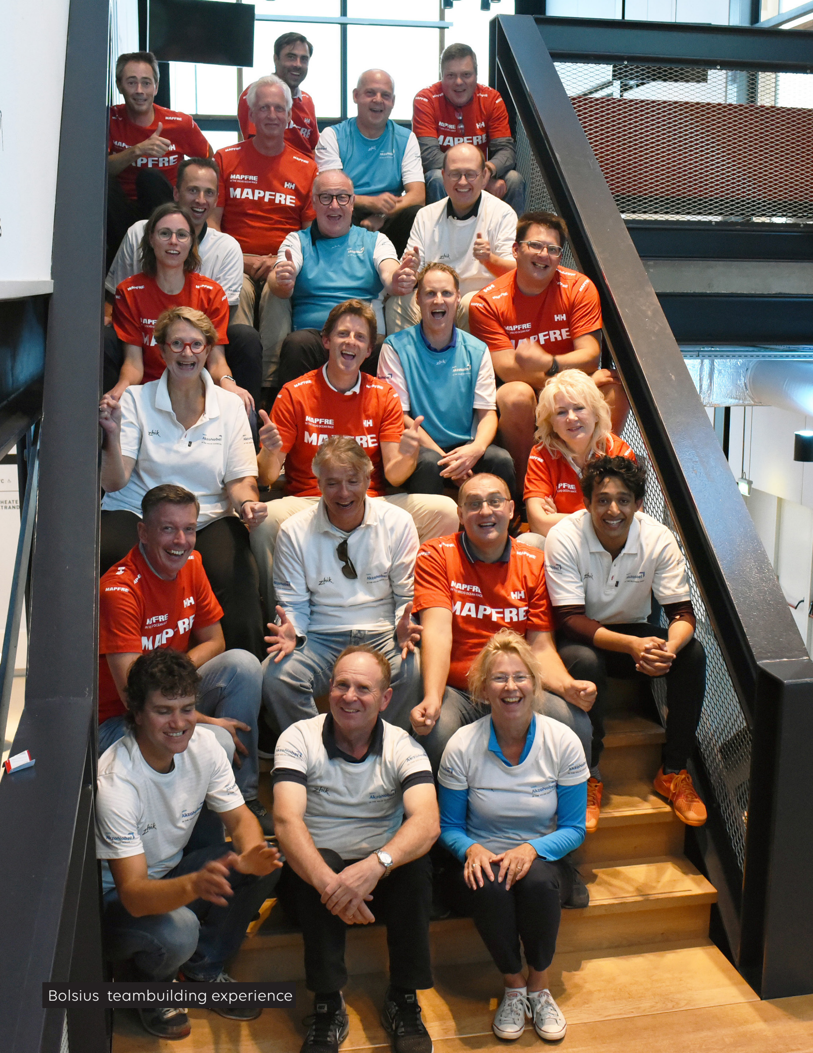
Bolsius teambuilding experience