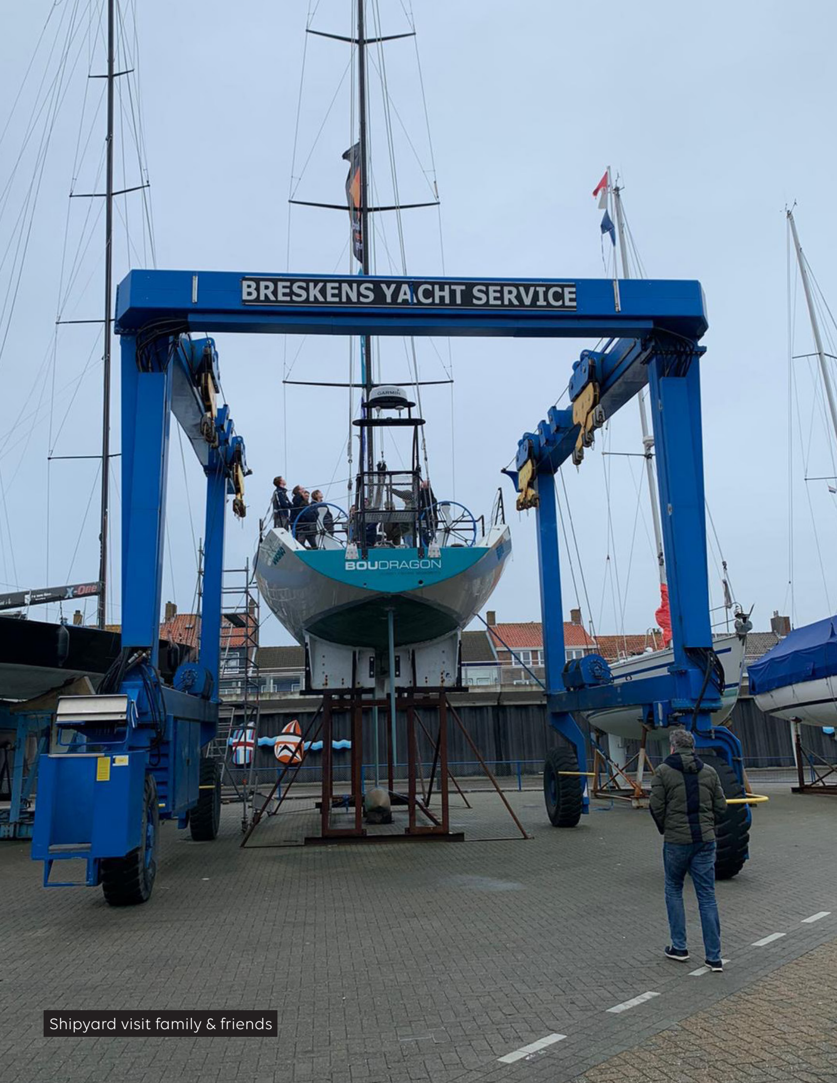
Shipyards visit family & friends